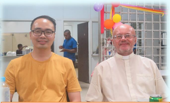
Welcome to Papua New Guinea